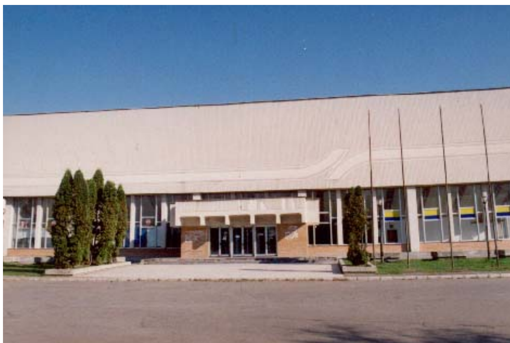
The sports centre from Bistrița

In the field of sports, one can mention the 104 sports fields, 4 swimming pools, 28 gyms, 7 sports centers and stadiums. The football team Gloria Bistrița plays in the country's first football league.