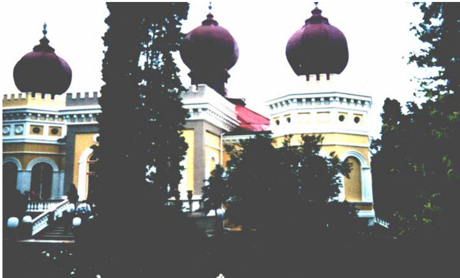
The castle from the Arcalia arboretum

The county has many natural reservations like: Rodnei Mountains National Park, Călimani Mountains National Park with special rocks, minerals and geological structures, mountain fauna and flora with rare species, Arcalia Arboretum in Șieu-Măgheruș where rare species of trees and shrubs can be seen.