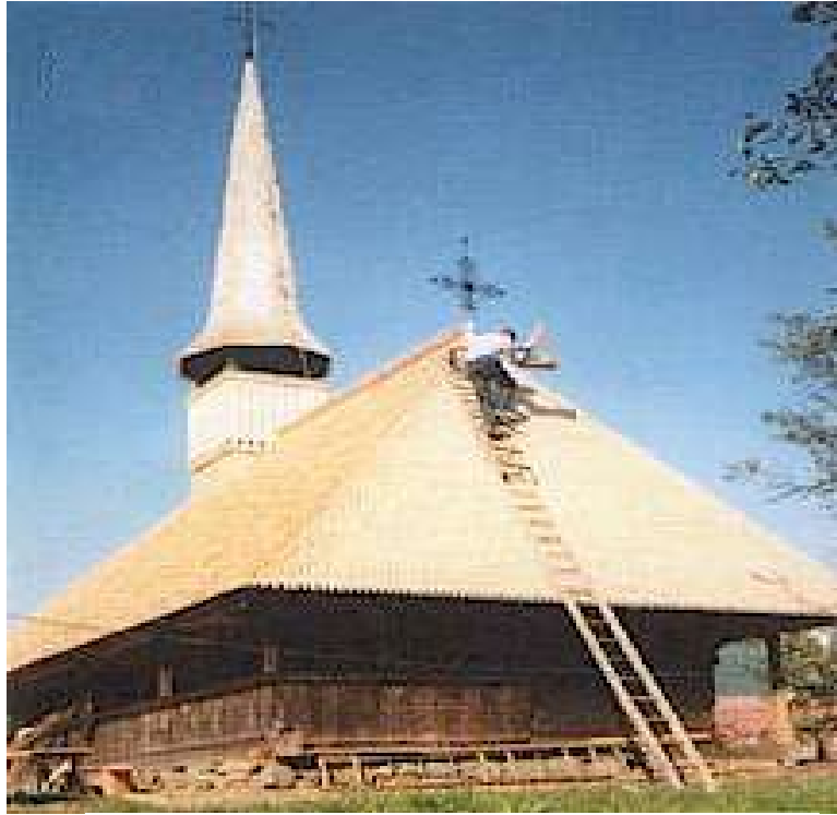
Wood church from Bistrița-Năsăud county

In the mountain areas of the county one can practice mountaineering, walking tours can be organized and at Piatra Fântânele one can practice winter sports.