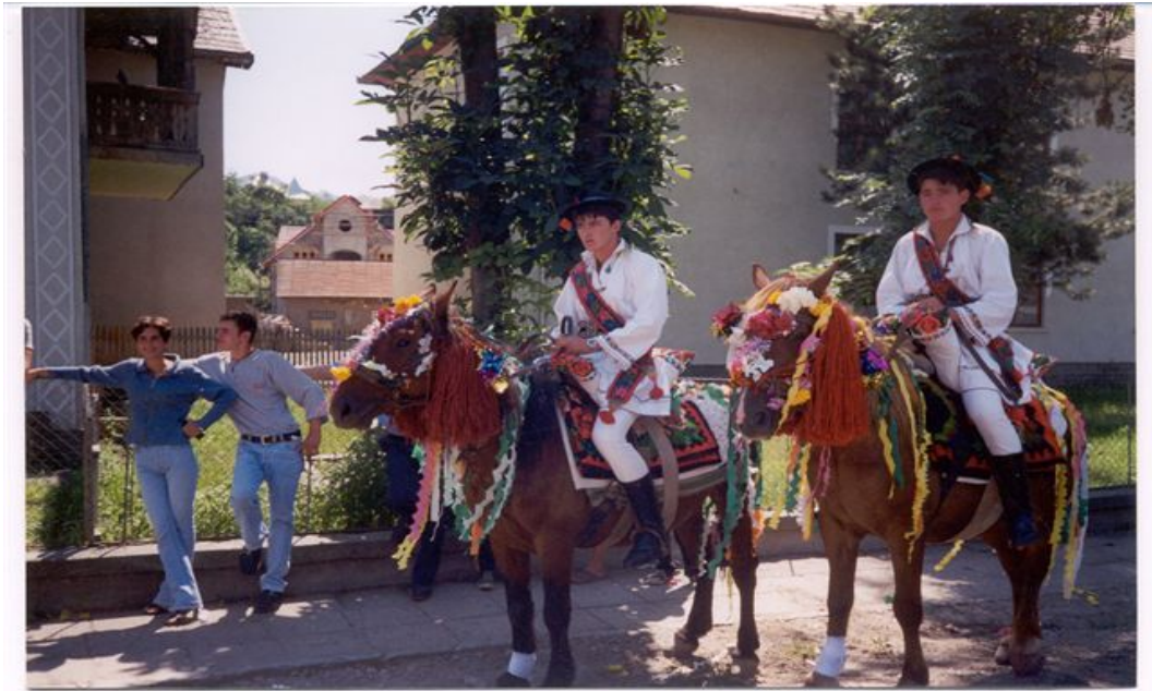
Folklore and traditions in Bistrița-Năsăud county

As they are situated in a lovely landscape, in an area with a pleasant climate and with a high tourist potential, Piatra Fântânele, Colibița, Valea Blaznei, Valea Vinului, Fiad, Cormaia have become important tourist attractions.