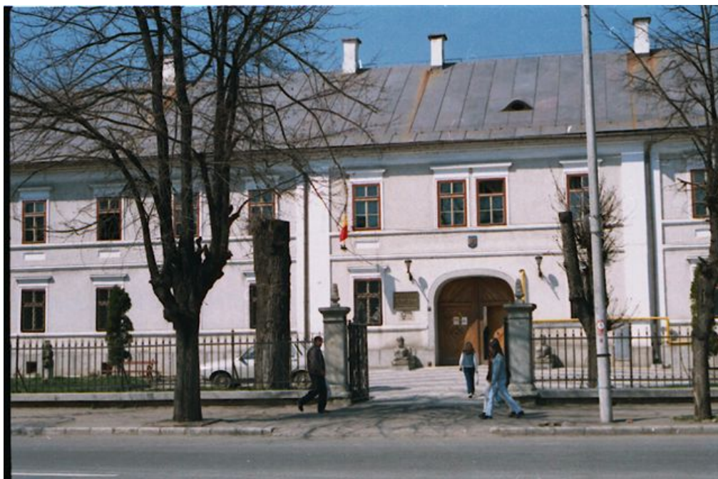
The County Museum Bistrița-Năsăud

Bistrița-Năsăud county has several cultural symbols that can support its tourist potential. Such tourist and cultural locations are: the homes and now museums of great Romanian writers – „George Coșbuc” Museum in the George Coșbuc village, „Liviu Rebreanu” Museum in Maieru and Liviu Rebreanu village, „Ion Pop Reteganul” Museum in Petru Rareș (Reteag). Other cultural tourist attractions are the County’s Museum, Museum of the Guards in Năsăud and the Under the Gate Museum.