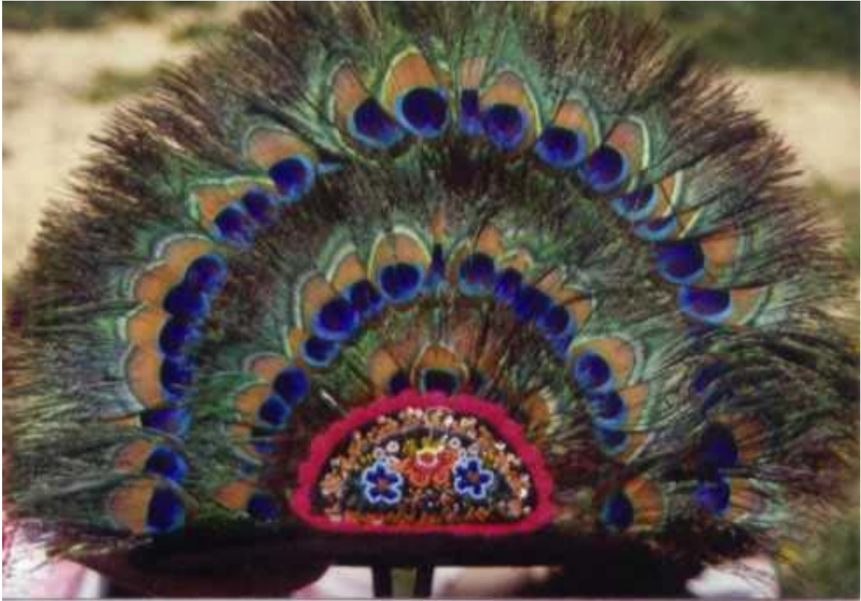
“Peacock feather” – adornment element of the male traditional costume from the Năsăud area