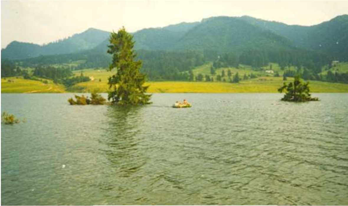
Storage lake Colibița

In the rifts and the shell of the volcanic mountains there are also mineralised phreatic waters.