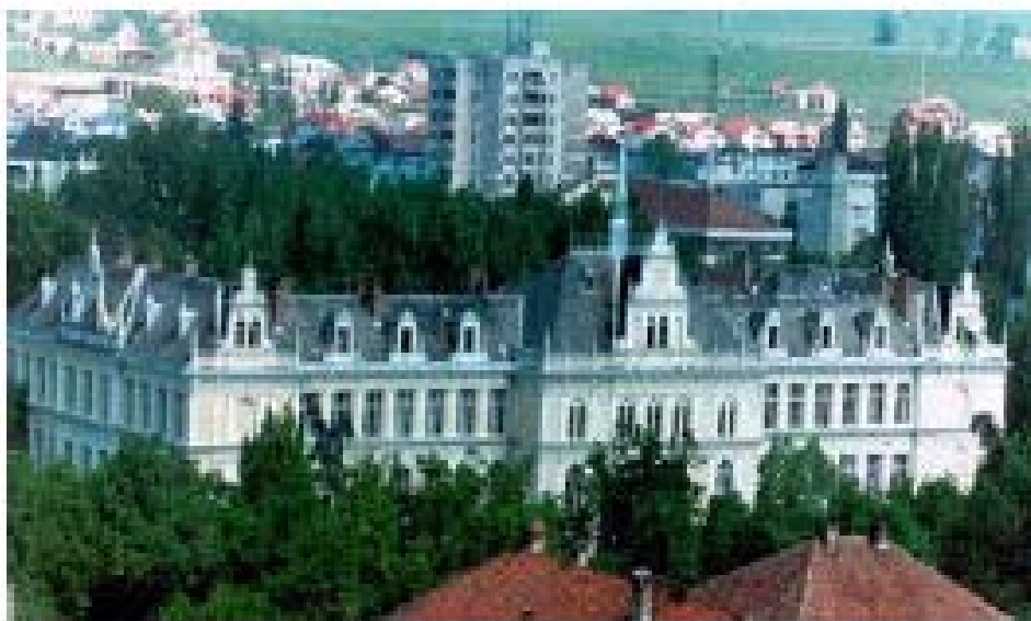
National College Liviu Rebreanu

Elementary and middle school is well provided, there are 263 educational units in the county, a music school and 3 special education institutions.