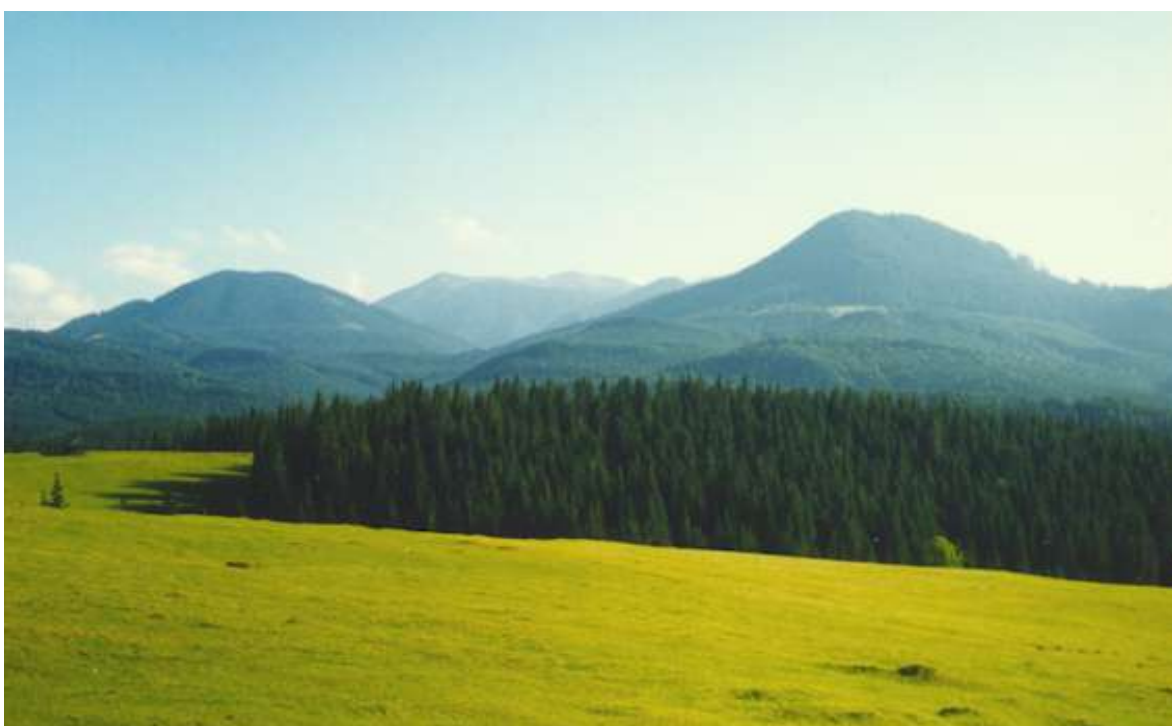
Forests in Bârgăului Mountains

The Bistrița Working Party for the Research and Development of Fruit Farming has as objective the research in the field of fruit growing and the development of new apple, pear, plum, cherry, sour cherry varieties and the improvement of agricultural technologies.