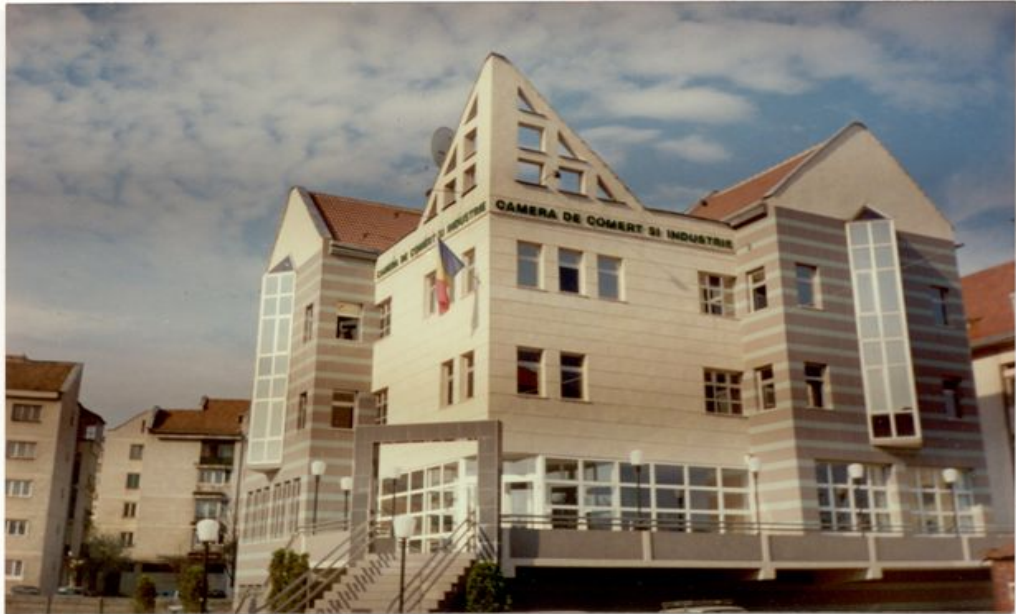
Chamber of Commerce, Industry and Agriculture Bistrița Năsăud

The geographic position of the county, the landform, the socio—economic conditions offer investors business opportunities related to: