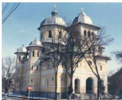
Historical monuments from Bistrița-Năsăud county

Only 500 metres away one can see an orthodox cathedral and nearby a fragment of the defense wall that used to surround the city of Bistrița. Other quite large fragments of this wall can be seen near the city's park, where they embed a defence stronghold „The Coopers' Tower”.