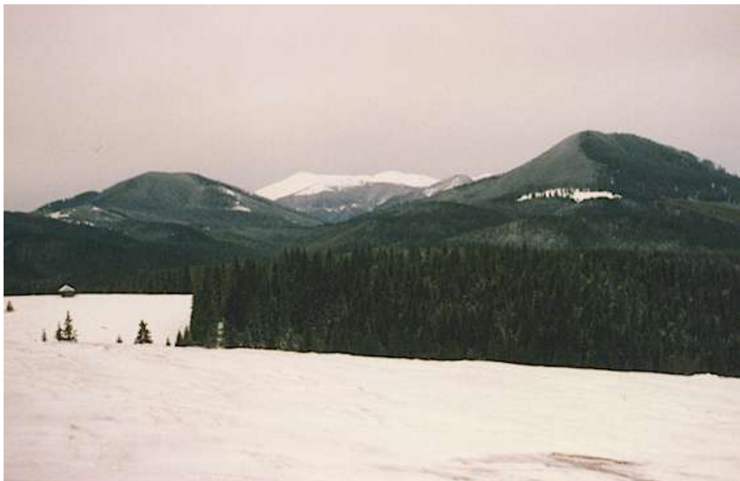
Winter landscape from Bârgăului mountains

In the mountain areas of the county one can practice mountaineering, walking tours can be organized and at Piatra Fântânele one can practice winter sports.