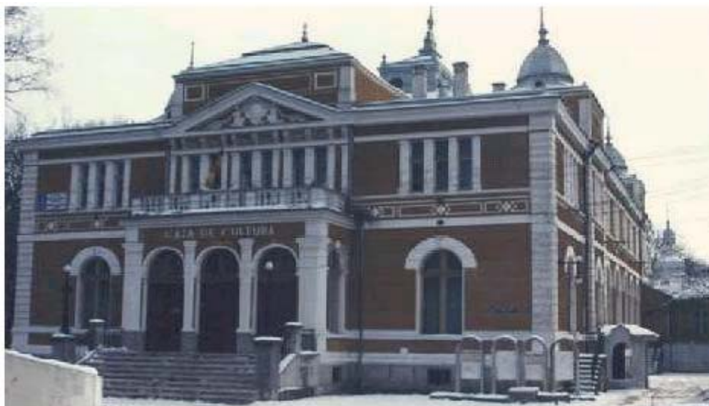
Cultural Centre George Coșbuc

In the field of culture, one has to mention the county's 8 museums, 4 cultural centers, 56 town halls, 129 libraries – a specialized one, 60 school libraries and 60 public libraries.