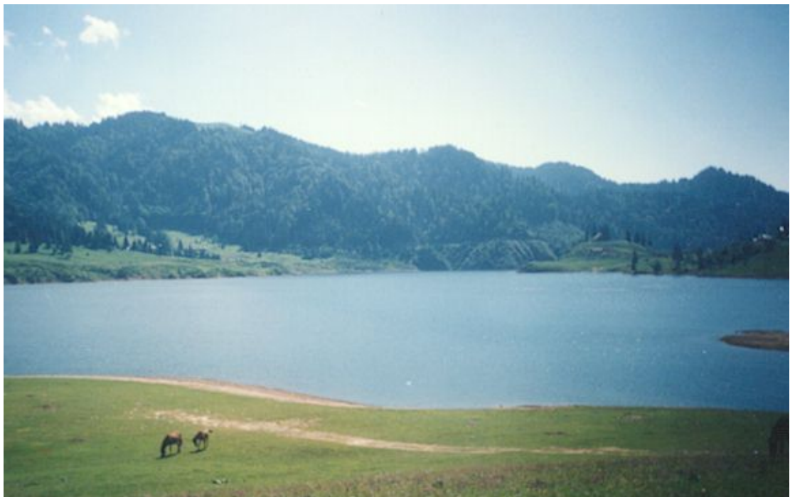
Mountain landscape - Colibița

As they are situated in a lovely landscape, in an area with a pleasant climate and with a high tourist potential, Piatra Fântânele, Colibița, Valea Blaznei, Valea Vinului, Fiad, Cormaia have become important tourist attractions.