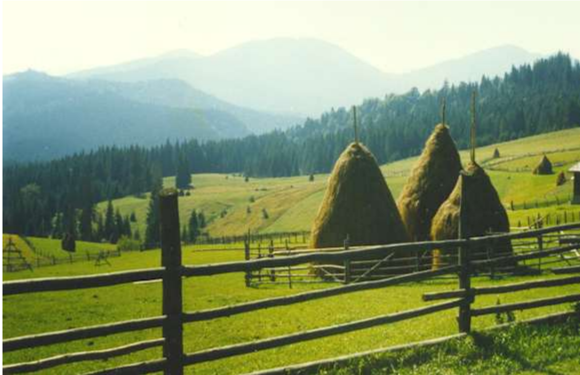
Mountain scenery from Bistrița-Năsăud

As far as air transportation is concerned, Bistrița-Năsăud county is served by the Cluj-Napoca airport, situated at 125 km from Bistrița or by the Târgu Mureș airport situated at approximately 100 km from Bistrița.